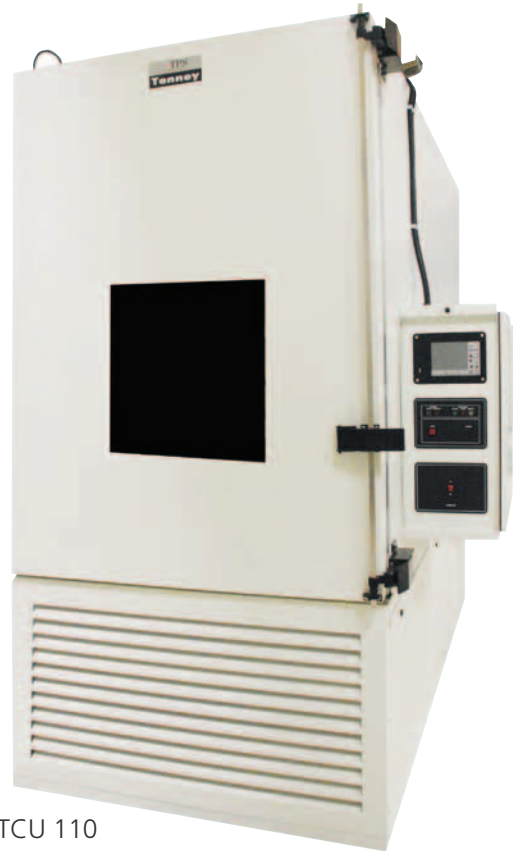
Tenney ETCU 110